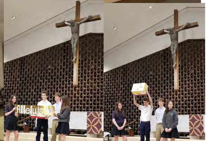
“Burying” the Alleluia