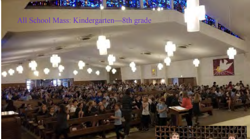
All School Mass: Kindergarten—8th grade