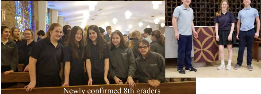
Newly confirmed 8th graders