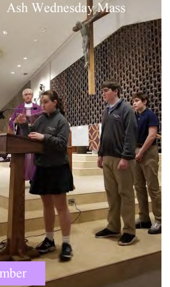
Ash Wednesday Mass