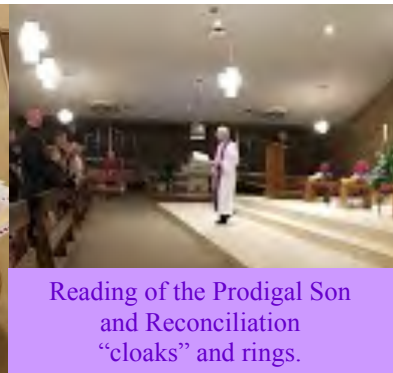
Reading of the Prodigal Son and Reconciliation "cloaks" and rings.