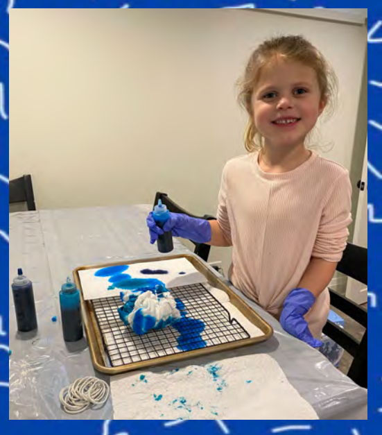
FAMILY TIE-DYE FUN!